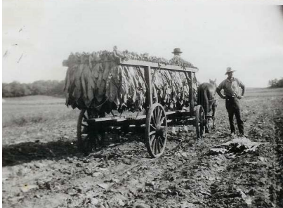
Dane County WI and their Norwegian immigrants became tobacco farmers