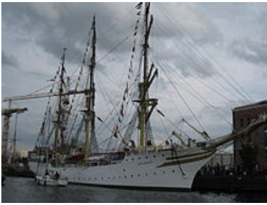
SS Sørlandet

a private boarding school for high school aged students, but on a tall ship sailing the Atlantic Ocean. That ship has Norwegian roots as the tall ship SS Sørlandet.