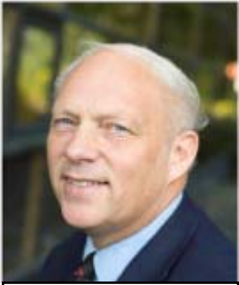
Bjørn Aamo— FATF President

What's that? The Financial Action Task Force (FATF) is an international, inter-governmental body established in 1989 by the Ministers of its 36 Member jurisdictions [including the U.S. and Norway]. The objectives of the FATF are to set standards and promote effective implementation of legal, regulatory and operational measures for combating money laundering, terrorist financing and other related threats to the integrity of the international financial system. The FATF is therefore a "policy-making body" which works to generate the necessary political will to bring about national legislative and regulatory reforms in these areas.