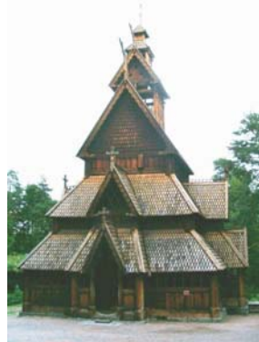
The Gol Stave Church (from Buskerud) was saved and moved to the Norwegian Museum of Cultural History near Oslo.