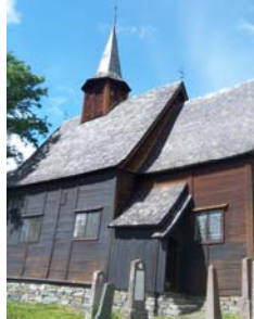
Lomen Stavkyrkje in Veste Slidre Norway dates from 1192

One of the fascinating aspects of Norway are the collections of ancient churches that are scattered across the country. They are a reminder of the basis and transformation of the Christian faith of our ancestors. The origin of these buildings trace to the Viking age, even though many are still in use a millennium later. The structures combines those Viking elements & those of the early catholic church of Norway. It binds them with the transformation of the protestant reformation.