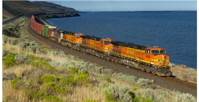
Four Burlington Northern/Santa Fe (BNDP) GE C44-9W diesel locomotives hauling a mixed freight train along the Columbia river, between Kennewick and Wishram, Washington State, USA.